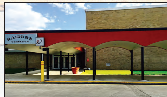
Highlighted above: 10.6' x 10.6' Walkway installed in NE corner of grassy area, West of the West Front Entrance of Wapahani High School.

Graduates, Teachers, Principals, Superintendents, “In Memory of” or “In Honor of” any of the fore mentioned from Wapahani, Center or Selma High Schools will be eligible to make a Donation(s) for Engraved Bricks.