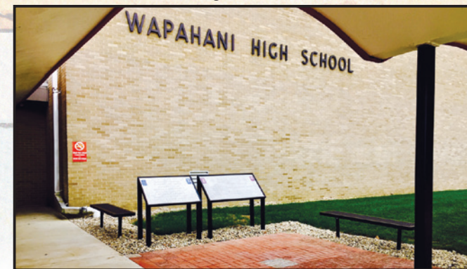
Highlighted above: 10.6' x 10.6' Walkway installed in NE corner of grassy area, West of the West Front Entrance of Wapahani High School.

Veterans, Graduates, Teachers, Principals, Superintendents, “In Memory of” or “In Honor of” any of the fore mentioned from Wapahani, Center or Selma High Schools will be eligible to make a Donation(s) for Engraved Bricks.